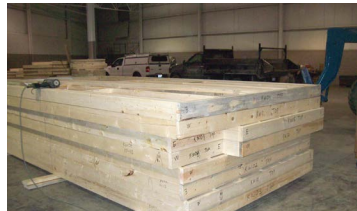
Pre-built interior walls