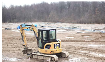
Current construction site